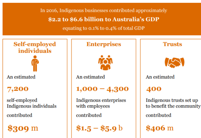
Figure 1: The economic contribution of Indigenous businesses (real 2016 terms) 5

Although there is not a universal definition 2 , the IPP defines an Indigenous business as one that is at least 50 per cent owned by an Indigenous person or people. 3 Economic modelling undertaken by PwC’s Indigenous Consulting (PIC) and PwC revealed that, based on this definition, there are up to 11,900 Indigenous businesses across Australia which together contributed between $2.2 and $6.6 billion to Australia’s economy in 2016 (see Figure 1). These businesses include self-employed individuals, enterprises and trusts. 4